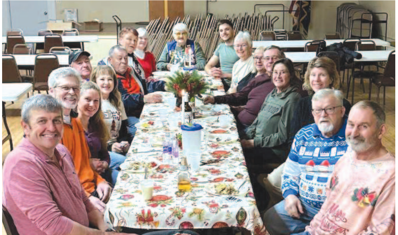
Zeeland Lions celebrate Christmas with Turkey dinner. New members and spouses were welcomed to the Lion's Den. Their pinocle tournament raised funds for the town's upcoming 125 Birthday. Hats off to Zeeland Lions

Sterling Lions are dedicating all funds from their bingo games to help cover transportation costs of a local rancher visit his wife and premature baby in Fargo