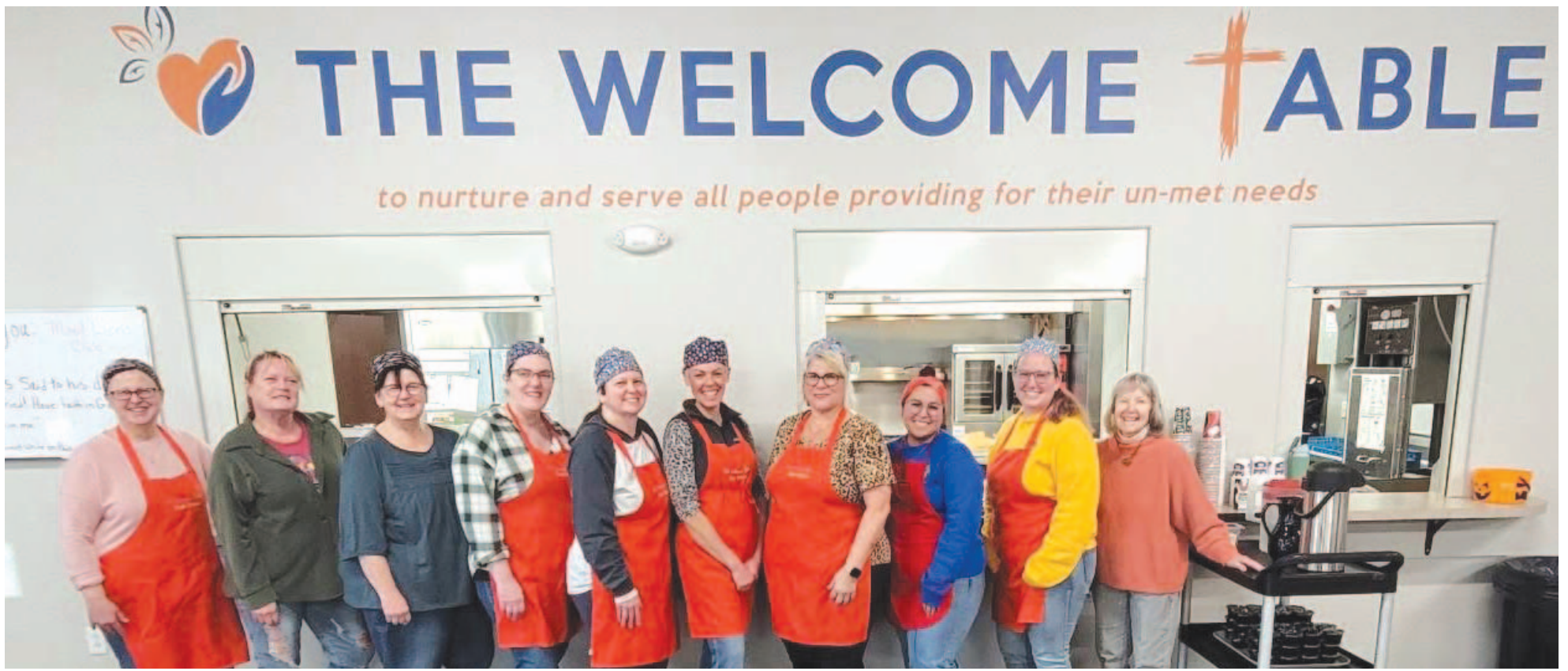
Minot Lions Club volunteers at the Welcome Table