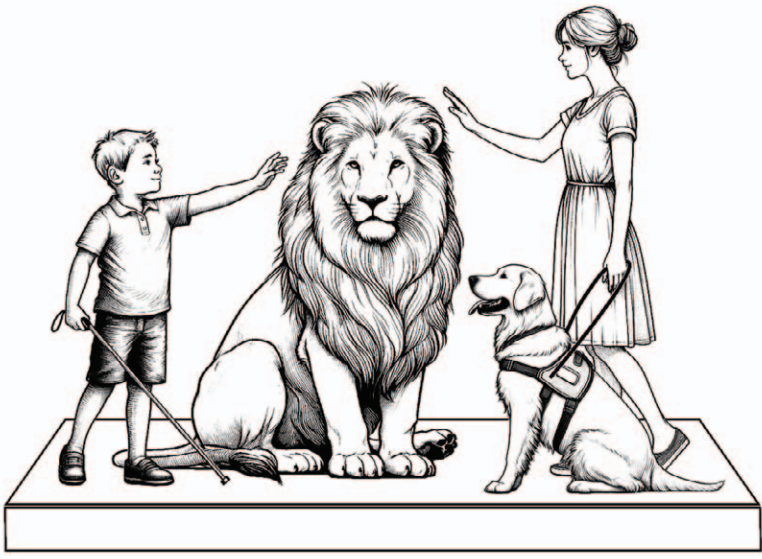
Artist's sketch of the Statue of Service