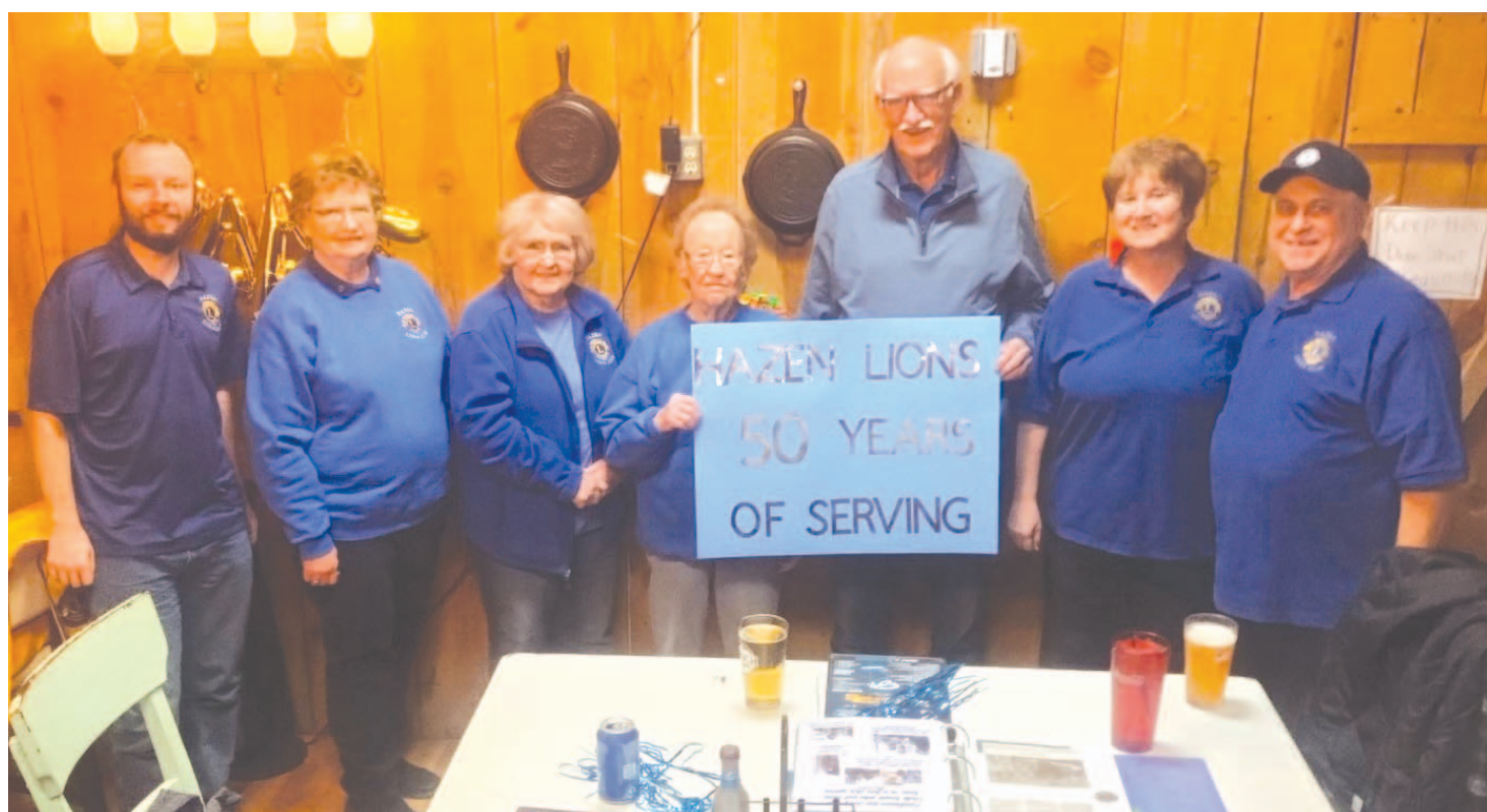
Hazen Lion's 50th Anniversary Party at Harbor Bar & Grill Their food, atmosphere and service is fantastic. Today's Special Prime Rib with baked potato. Unbelievably good!