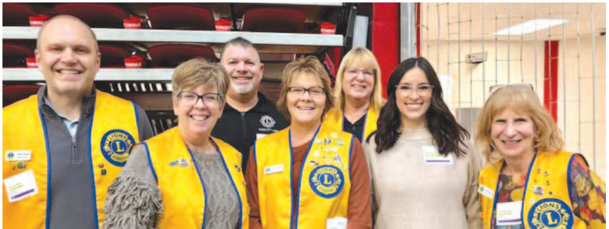
Some of our Magic City Lions had the chance to volunteer at Marketplace for Kids, where we met amazing young entrepreneurs and saw their creative inventions in action. It was inspiring to see their ideas, confidence, and hard work on display! We're proud to support opportunities that empower kids to dream big and learn by doing